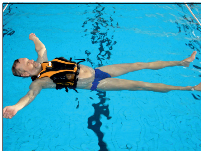
Life vest – practical test