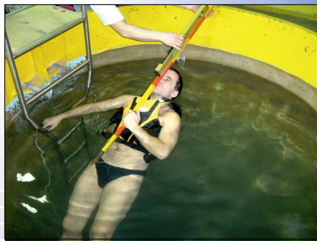
Life vest – practical test