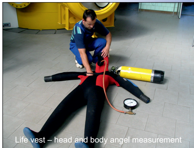
Life vest – head and body angle measurement