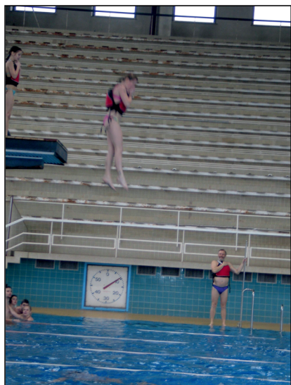
Life vest – practical test (3 m jump)