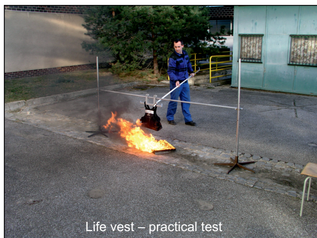
Life vest – practical test