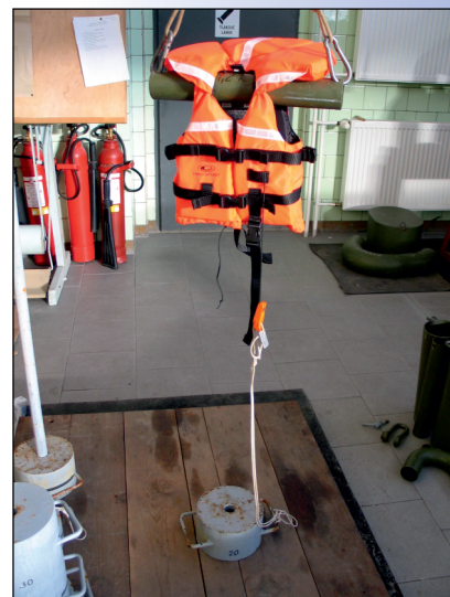
Life vest – pull test