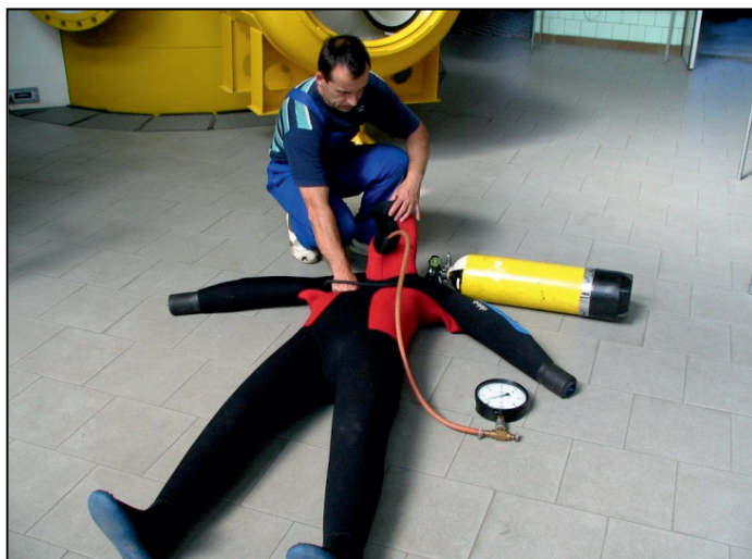
Inspection place of pressure vessels