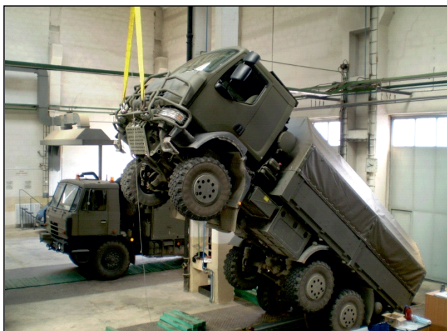
Measuring the vehicle center of gravity