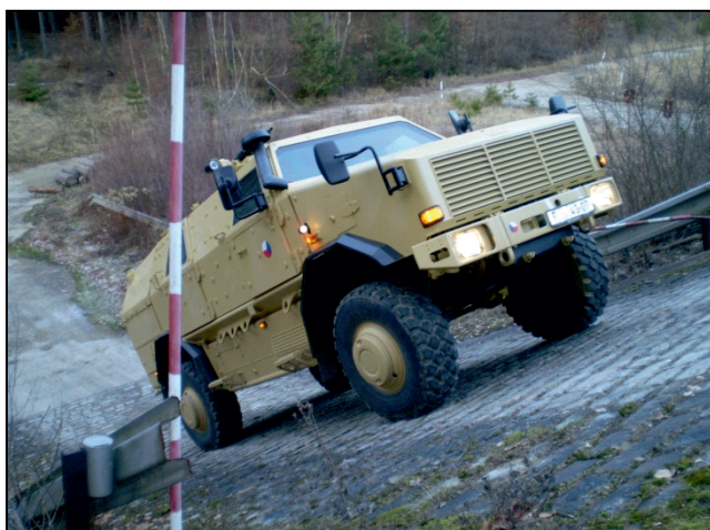
Testing of the vehicle's grade ability